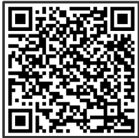
All Learning Content Related to this Topic

Solutions: Hello. I would like to rent a car. / What kind of car were you thinking of? / A mid-size one with automatic transmission. / We have a mid-size Ford available if that works? How long do you want to rent it? / Eight days. Is it possible to extend the contract if necessary? / Yes, that is no problem. Just call us beforehand and let us know. / How much is the car per day? / It will be $75 not including insurance. Would you like to purchase insurance? / No, my credit card company will cover the insurance. I would like to add an additional driver though. / That's no problem, but it will cost an additional $10 a day. / That's ok. The car has unlimited mileage, right? / Yes, it does. Here is the contract. Please sign at the bottom. / Looks good, thank you. / You're welcome. Your car is in spot B32 and have a nice day.