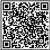
Listen to the Dialogue